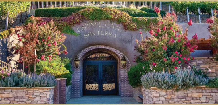
The Meritage Resort and Spa

NAPA VALLEY, CALIFORNIA NAPA VALLEY, CALIFORNIA