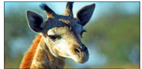
SAN DIEGO ZOO & SAFARI PARK (30 miles)

Experience thrilling rides inspired by the force and power of the sea. Enjoy fabulous, family-friendly shows and presentations. Explore beautiful aquariums, visit sea animals and much more! www.seaworld.com/san-diego