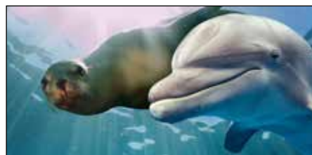
SEAWORLD ADVENTURE PARK (27.5 miles)

See more than 5,000 fish in 60+ habitats plus a museum featuring cutting edge research from Scripps Institution of Oceanography, UC San Diego. Take in spectacular panoramic ocean views, get hands on with interactive activities, see a feeding, and dive deeper into the world under, in, and above the oceans. https://aquarium.ucsd.edu