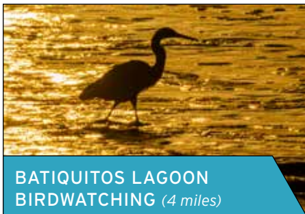
BATIQUITOS LAGOON BIRDWATCHING (4 miles)

There are more than 10 beautiful, sandy beaches to explore in the San Diego area. Read about the different options here: https://www.omnihotels.com/hotels/san-diego-la-costa/things-to-do/area-attractions/san-diego-beaches