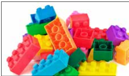
LEGOLAND (6 miles)

LEGOLAND is San Diego County's most popular local attraction, selling more tickets than SeaWorld, San Diego Zoo and San Diego Safari Park. Guests from across the country love to visit LEGOLAND's theme park and 3-D movie set. LEGOLAND offers more than 60 interactive rides, shows and attractions, as well as restaurants and shopping. There are more than 30,000 LEGO models in the park created from more than 62 million LEGO bricks. www.legoland.com