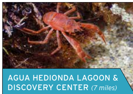
AGUA HEDIONDA LAGOON & DISCOVERY CENTER (7 miles)

Batiquitos Lagoon is a coastal wetland north of San Diego between the cities of Carlsbad and Encinitas. It is one of the few remaining tidal wetlands on the southern California coast of the United States. The area is run by the California Department of Fish and Wildlife as a nature reserve and is designated a Marine Protected area. http://www.batiquitosfoundation.org