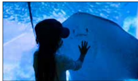
BIRCH AQUARIUM (19 miles)

LEGOLAND is San Diego County's most popular local attraction, selling more tickets than SeaWorld, San Diego Zoo and San Diego Safari Park. Guests from across the country love to visit LEGOLAND's theme park and 3-D movie set. LEGOLAND offers more than 60 interactive rides, shows and attractions, as well as restaurants and shopping. There are more than 30,000 LEGO models in the park created from more than 62 million LEGO bricks. www.legoland.com