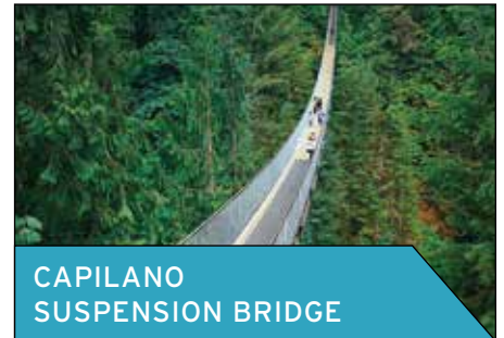
CAPILANO SUSPENSION BRIDGE

Vancouver's premier artistic and cultural hub, located in an urban, waterfront location and steeped in a rich industrial and maritime heritage, this unique destination attracts millions of visitors each year. The famous Public Market is home to more than 50 independent food purveyors and contributes to the island's appeal as a renowned culinary destination.